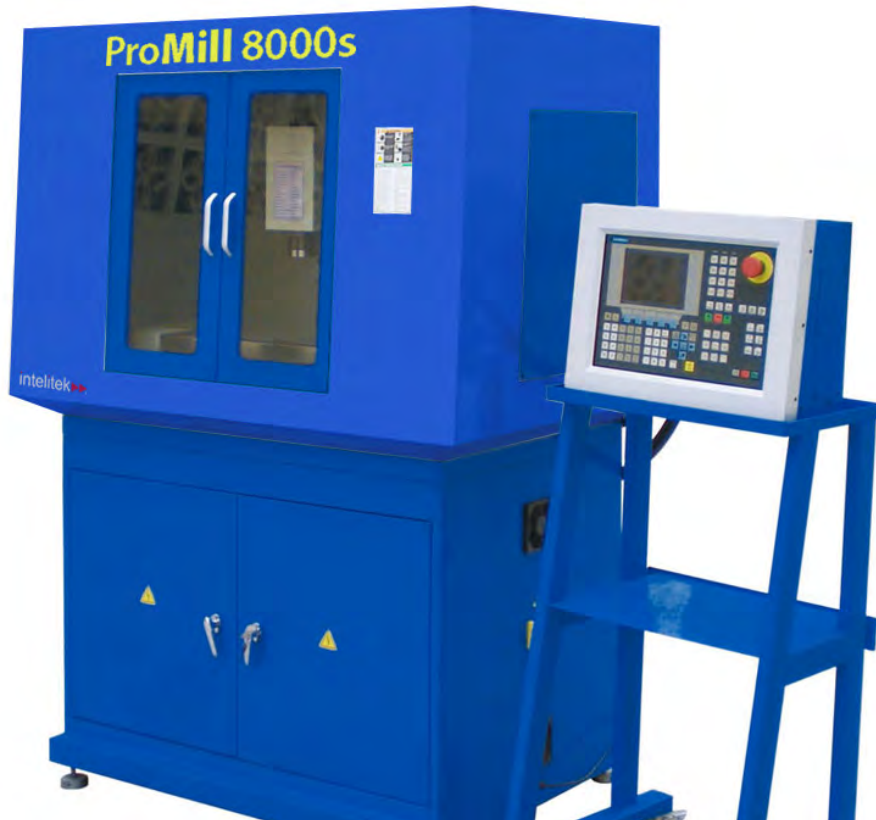
Machine shown with optional mobile control stand. Standard machine includes arm-mounted control (shown below).